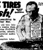
FABRIX INC., Dept. 233 325 W. Huron Street, Chicago

COSTS NOTHING to get complete information showing how one man in each town can establish local factory and make money from the start. Investment reasonable. Write today. All information is FREE.